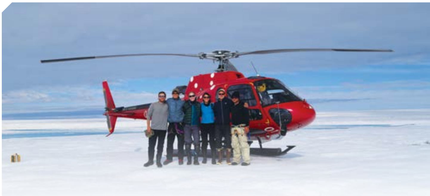
Geologists, climate scientists and modelers teamed up to ground-truth models in Greenland.