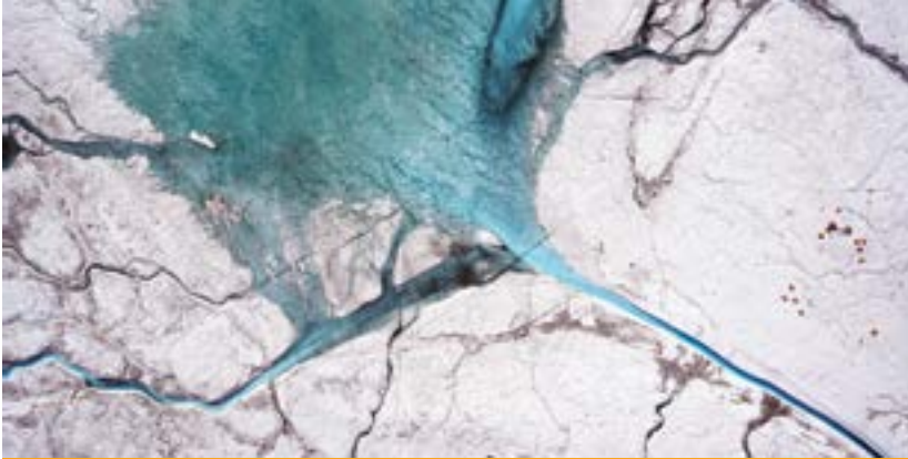
The team set up camp (lower right) beside a supraglacial river that dropped into a deep moulin.

Elevation breaks the glaciers that comprise the Greenland Ice Sheet into distinct zones. In the frigid higher elevations, glaciers have accumulation zones covered with snow and firn, the dense, compacted old snow that represents the middle ground between snow and glacial ice. At lower elevations, ambient temperatures are warm enough to melt away the snow and firn, leaving a bare ablation zone where ice melts, evaporates or sublimates in the sun. A team led by UCLA's Laurence C. Smith worked in the mid-ablation zone, where runoff is high—just right for studying the evolution of the ice sheet and beginning to understand the future of glacial melting in a changing climate.