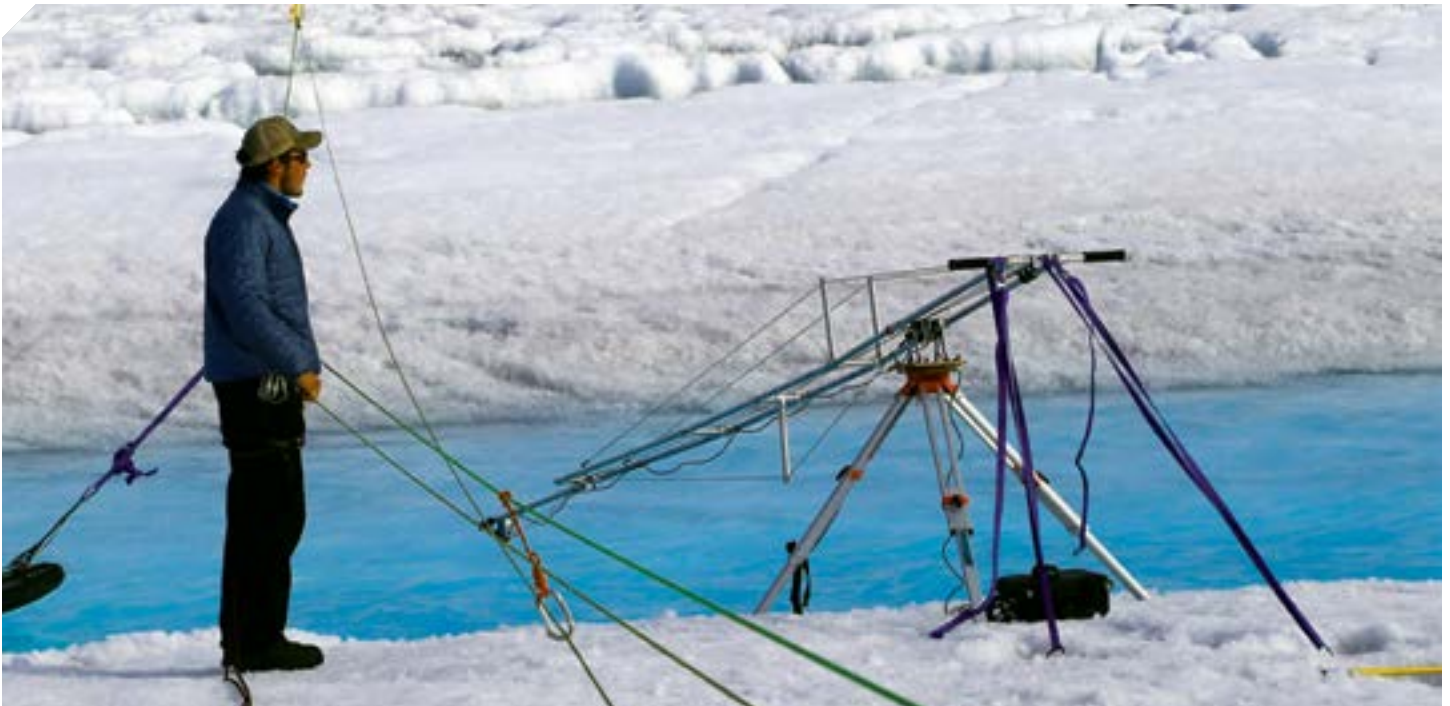
Safety harnesses and robust instruments are vital when working on a fast river that drops deep into the ice.