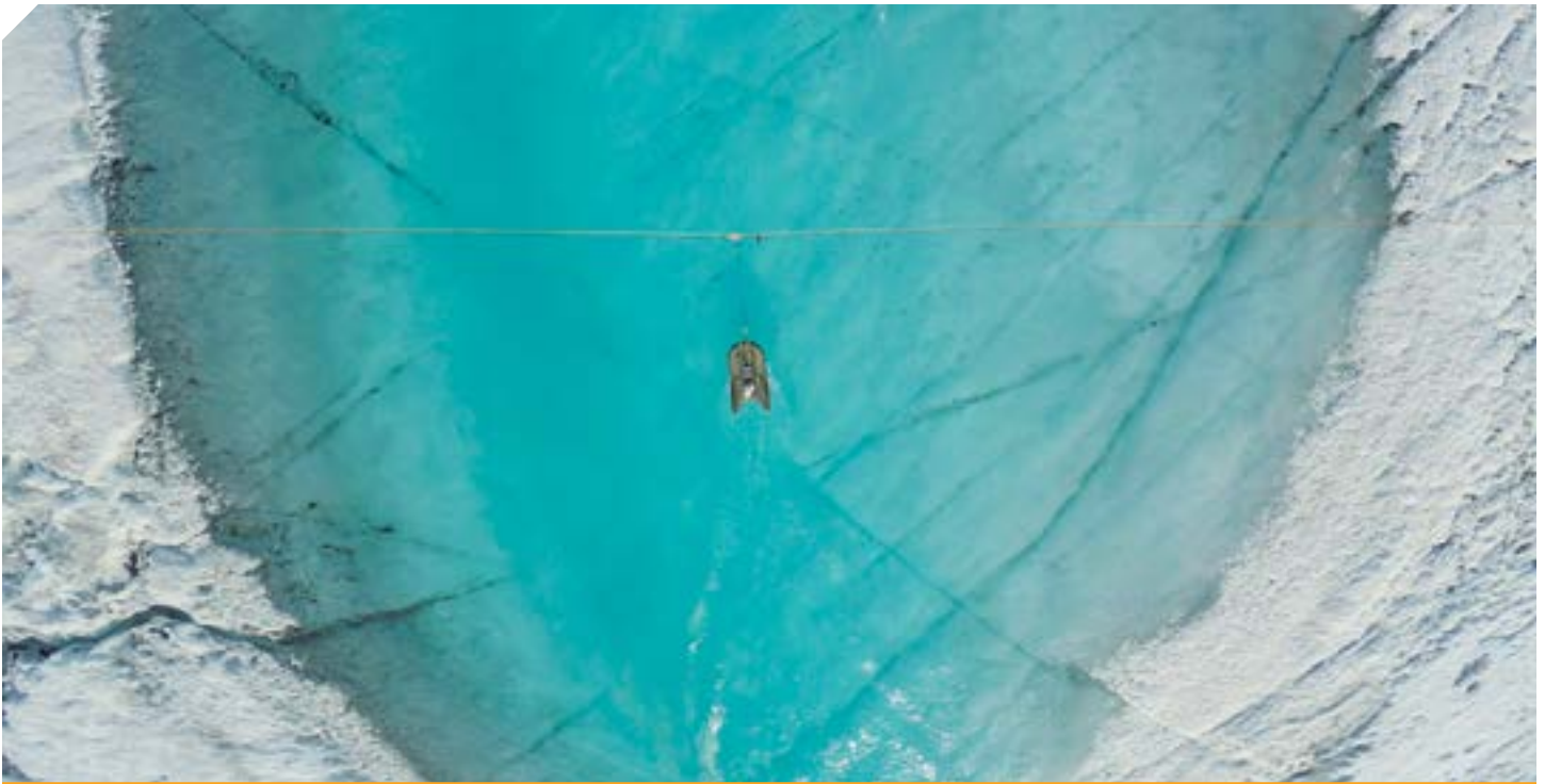
The RiverSurveyor M-9 uses two frequencies to ensure optimum signal for velocity, depth and direction measurements.